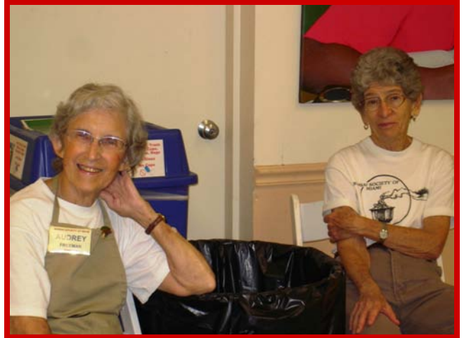
The club's angels.