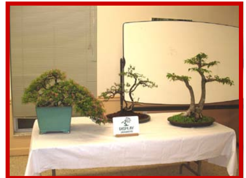
Display table 2.