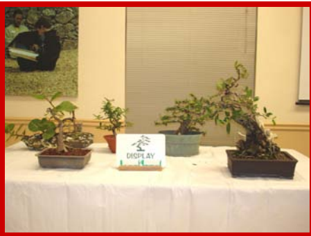
Display table 1.