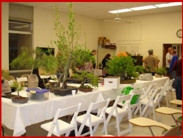
Lots of trees to be worked.