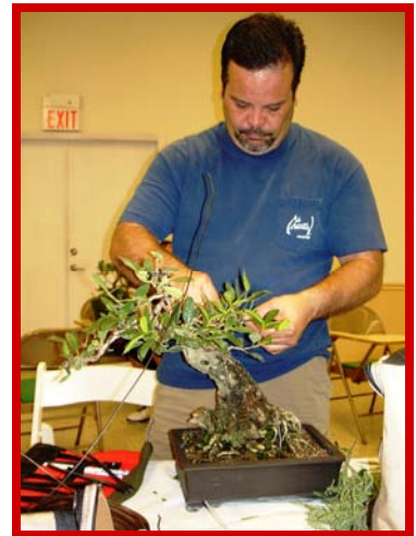
The Bonsai Ambassador.