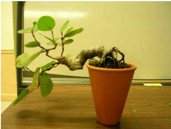
A Seagrape with small leaves .