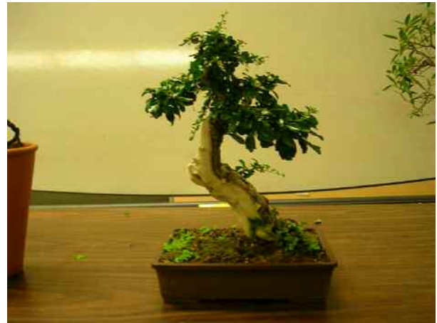
Victor's Elm with the mysterious White leaves.