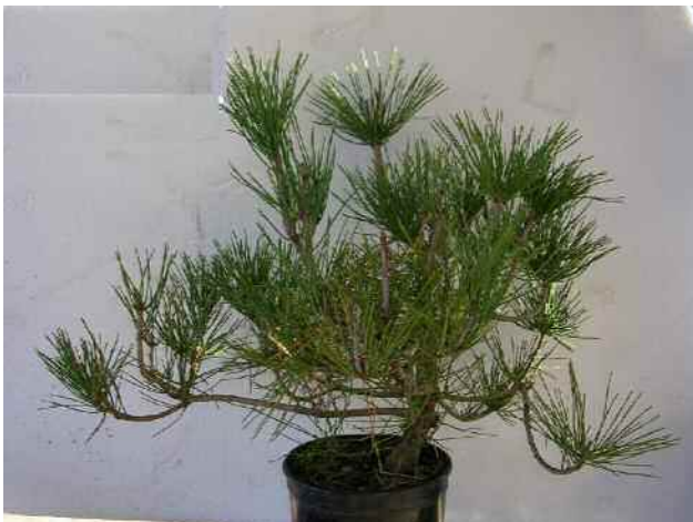
A Black Pine similar to the one Ted started with.