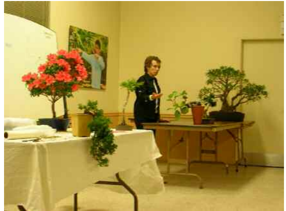
There were many varieties of trees and a wide range of topics.