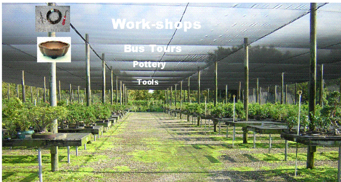
Pre-Bonsai Finished Bonsai New trees, tools and pottery have arrived.