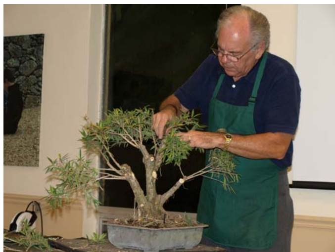
Now he begins to refine the branches.