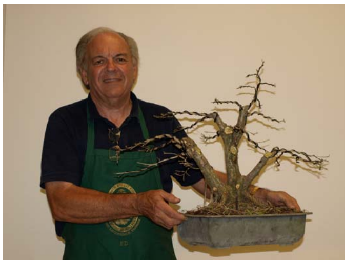
A "Master Piece" for the raffle table.