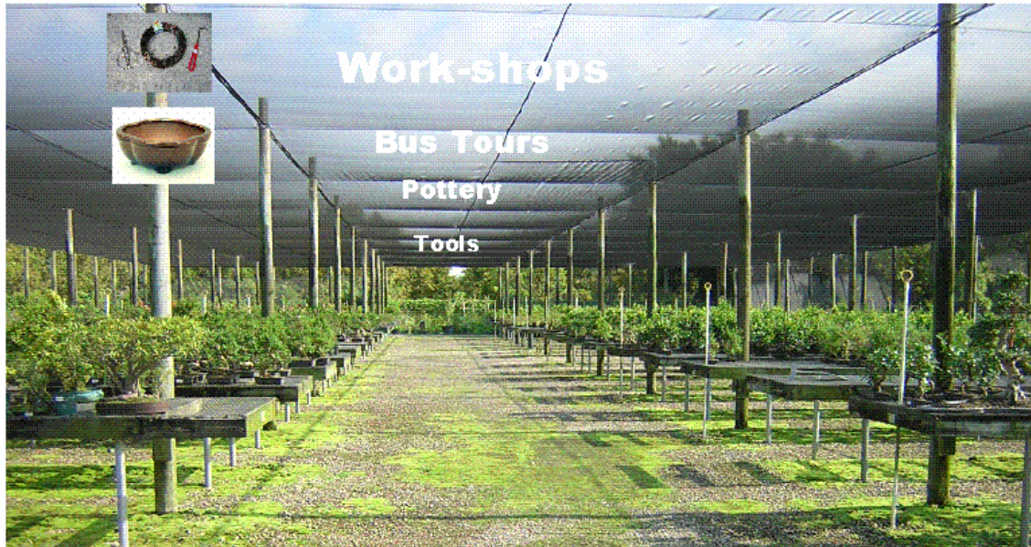
Pre-Bonsai Finished Bonsai New trees, tools and pottery have arrived.