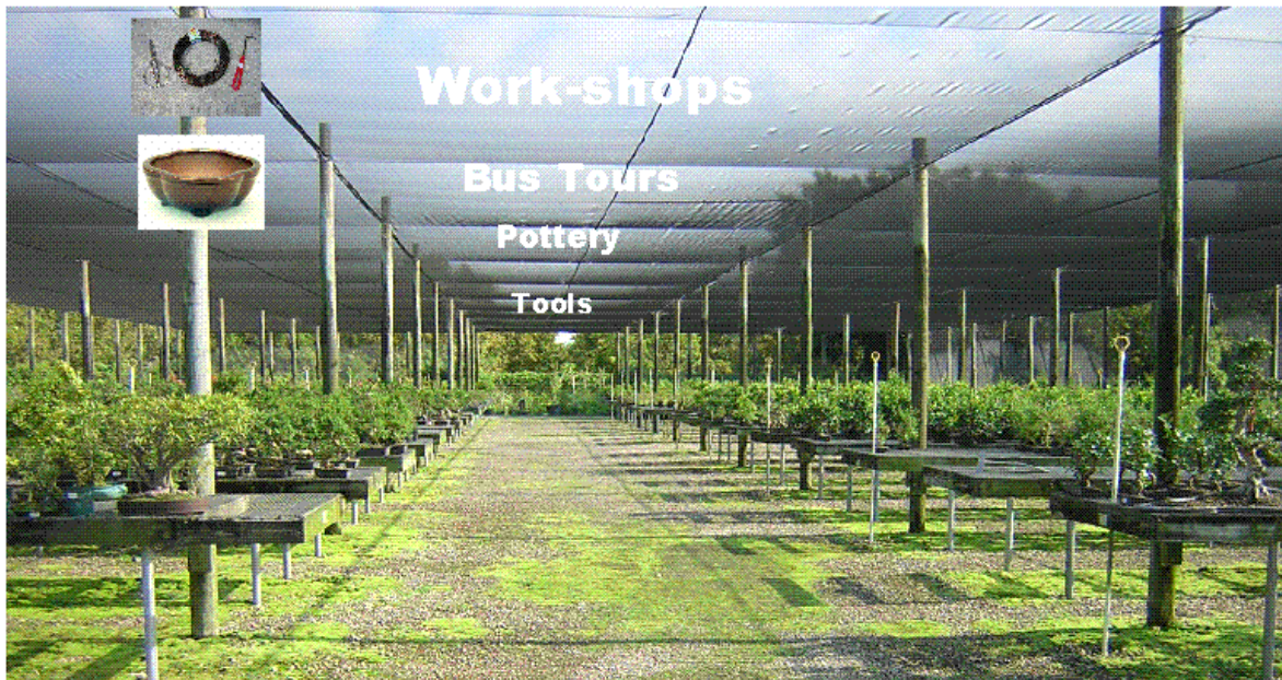
Pre-Bonsai Finished Bonsai New trees, tools and pottery have arrived.